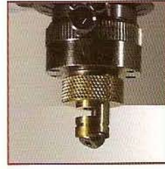
Steel swivel nose 2.5 mm diameter Part No. 22464