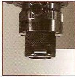
Steel nose 16 mm diameter Part No. 20960