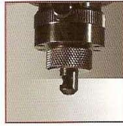
Steel nose 2.4 mm diameter Part No. 21755