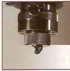
Steel nose 1.5 mm diameter Part No. 20131