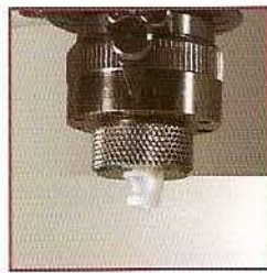
Teflon nose 3 mm diameter Part No. 20133