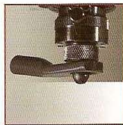
Vacuum nose 3.3 mm diameter Part No. 21672