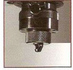
Steel nose 2.5 mm diameter Part No. 20132