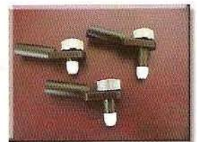
Teflon long-reach vacuum noses 2.5 mm diameter length: 12, 22, 27 mm No. 28061/28062/28063

*These noses can be made into vacuum noses with adaptor ref. 12720