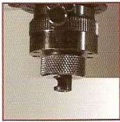
Steel nose 4.6 mm diameter Part No. 21086