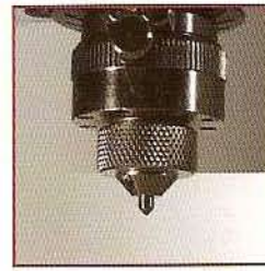
Fixed diamond nose Part No. 22884