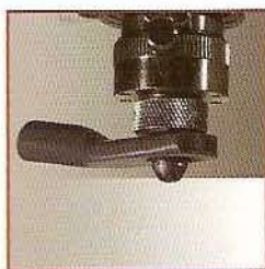
Vacuum nose 1.5 mm diameter Part No. 21674