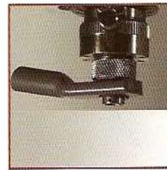
Vacuum nose 8 mm diameter Part No. 21673