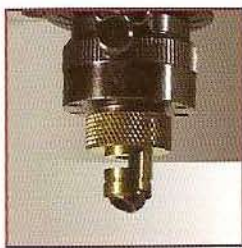
Steel swivel nose 5 mm diameter Part No. 13058