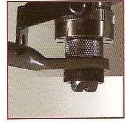
Swivelling prismatic nose Part No. 22885