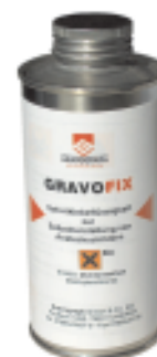
Ref. 19360 Gravofix

To protect jewellery and brass door plates during engraving. Size: 100 m x 50 mm