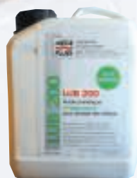
Ref. 23494 Lubricant

Designed for engraving and cutting on metals, this lubricant is extremely hard-wearing. Bottle: 215 g