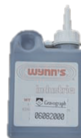
Ref. 19526 TARFIL

Designed for engraving and cutting on metals, this lubricant is extremely hard-wearing. Bottle: 215 g