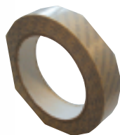
Ref. 20151 Adhesive mount tape

Repositionable glue for use with light materials for the temporary positioning of your plates. Not recommended with expanded polystyrene. Volume: 500 ml.