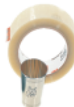
Ref. 19528 Protective adhesive tape

For temporary mounting of your plates Size : 25 m x 0.25 mm.