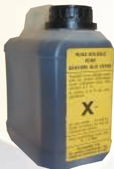
Ref. 12913 Soluble oil

Product designed for engraving on glass. Volume: 1 LTR.